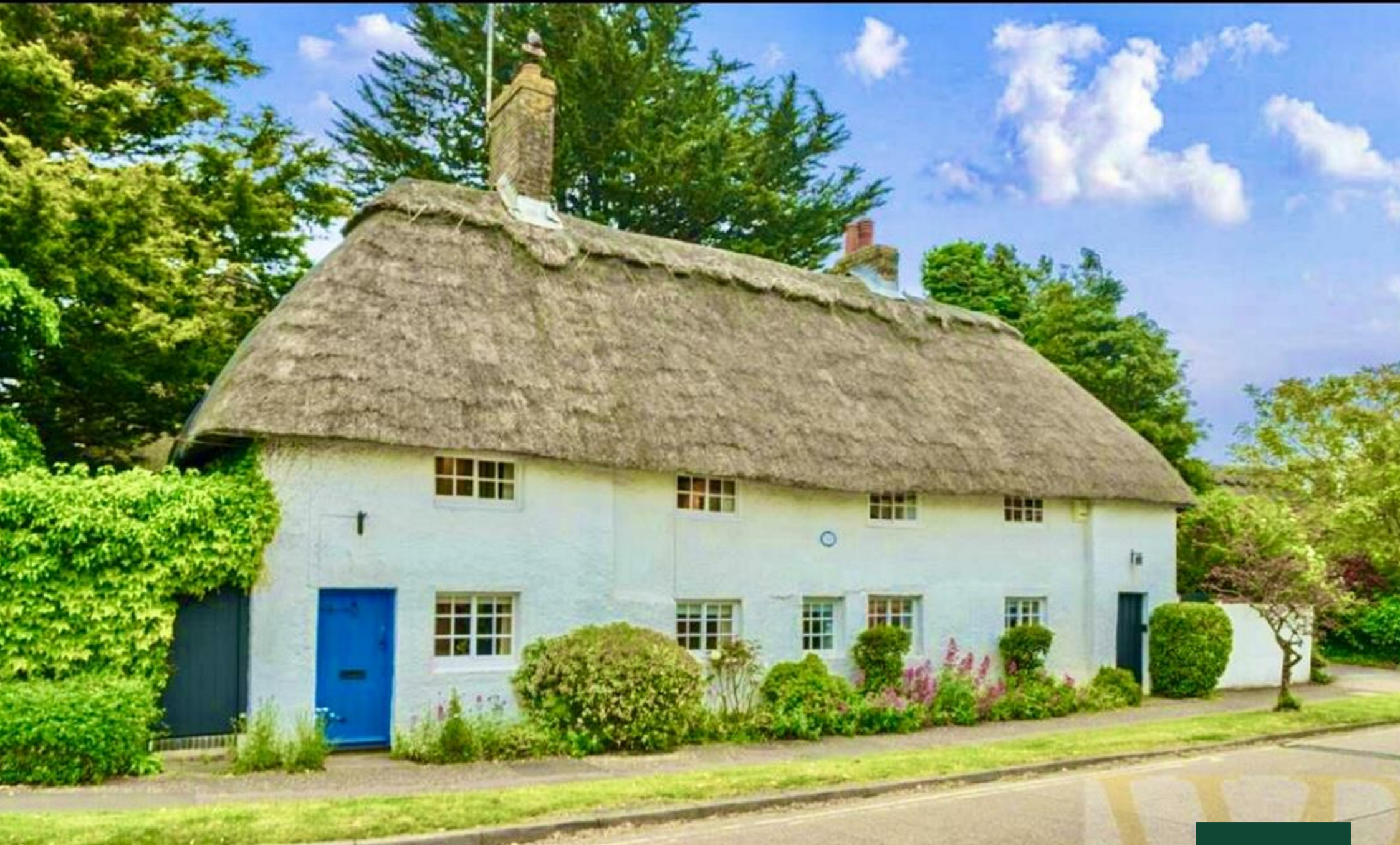
Thatch Cottage, 110 Connaught Avenue | | Shoreham-By-Sea BN14 2EW